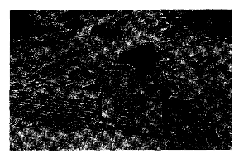
Fig. 1 — The bath-house complex from the south. In foreground(rt), the entrance to cool subterranean storage chamber.